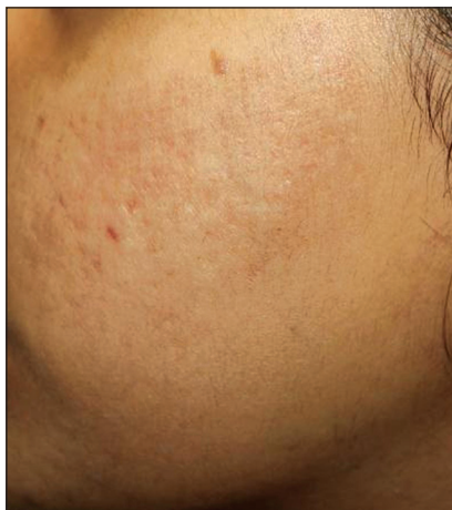
Figure 5: Adverse effect—track marks of the device probe