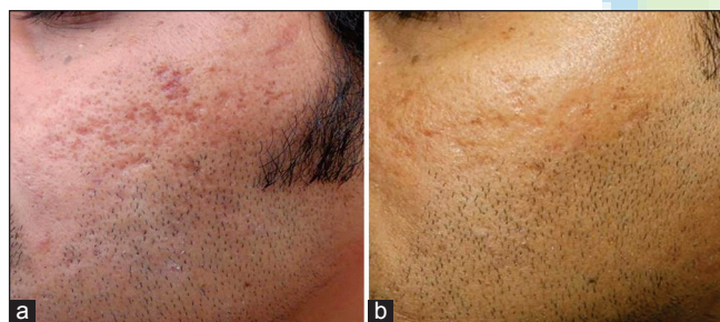
Figure 3: (a) Grade 3 acne scars, (b) Improvement in acne scars from Grade 3 to Grade 2 after treatment