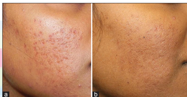
Figure 2: (a) Grade 3 acne scars, (b) Improvement in acne scars from Grade 3 to Grade 1 after treatment

The treatment was generally well tolerated. All patients underwent treatment-related pain. All patients had reported mild erythema for two days, two patients had oedema for more than three days, five patients reported post inflammatory hyperpigmentation and two patients had track marks of the device probe [Figure 5]. Social activity could commence as early as one day after treatment.